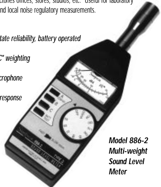
Model 886-2 Multi-weight Sound Level Meter