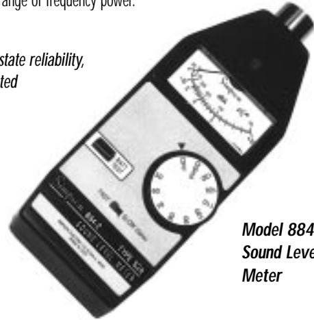
Model 884-2 Sound Level Meter